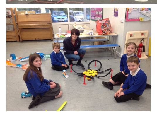
Early Birds enjoying some new games