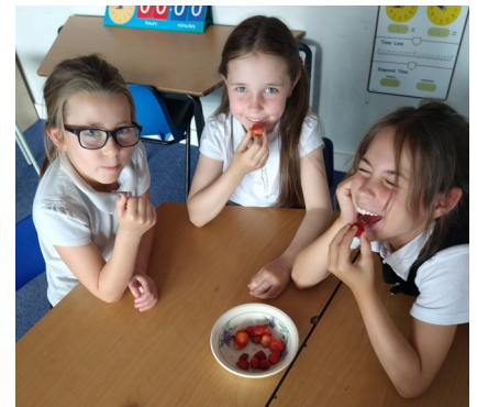
Class 2 enjoying the fruits of their labour