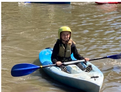
Class 3 had a super few days on their residential trip