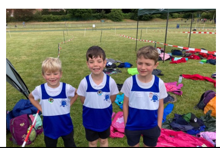
Our Y2 to Y6 children took part in the .William Brookes School Primary Sports Day . Well done to all who took part.