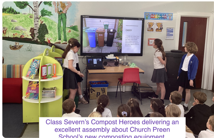
Class Severn's Compost Heroes delivering an excellent assembly about Church Preen School's new composting equipment.