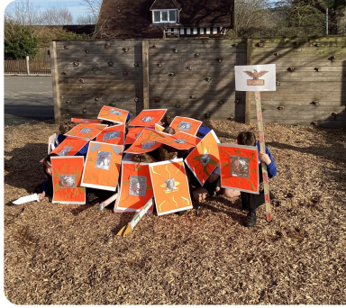
Class Severn demonstrating Roman battle formations with their own home made shields.