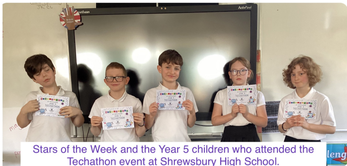
Stars of the Week and the Year 5 children who attended the Techathon event at Shrewsbury High School.