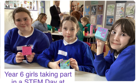
Year 6 girls taking part in a STEM Day at Shrewsbury High School.