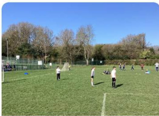
Excellent performances from all the children involved in the Cressage Cup last Wednesday