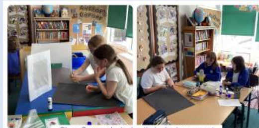
Class Severn designing their shadow puppet characters and theatres in Science.