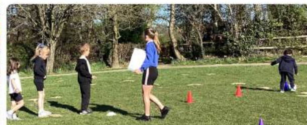
Bronze Ambassadors and Cound Class working hard in PE