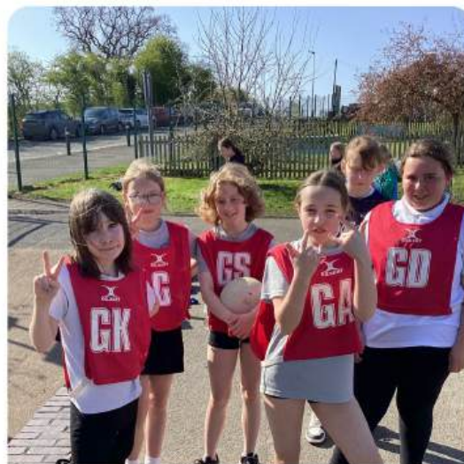
We were narrowly beaten by Brockton in the netball final