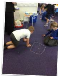
How to play Victorian marbles