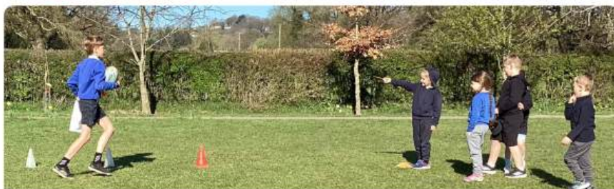
Bronze Ambassadors running a PE session for Cound Class