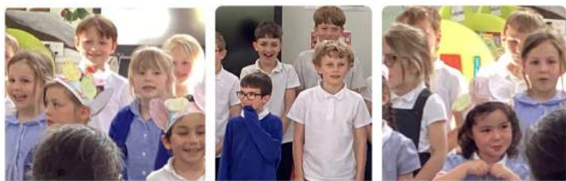
Church Preen's Spring Celebration Assembly