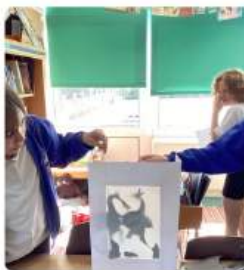
Shadow puppet work in Science 31/03/25