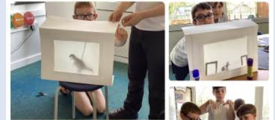
Some really effective images.