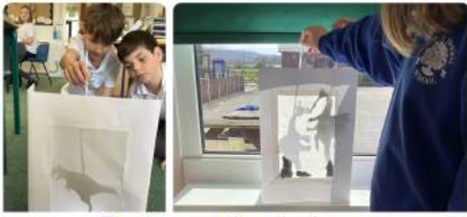
Testing out the displays.