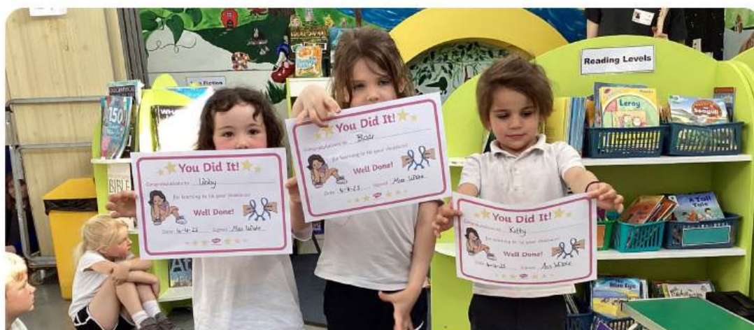
They can tie their laces! Can you?