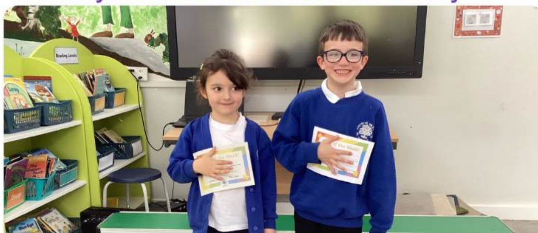
Our amazing Stars of the Week