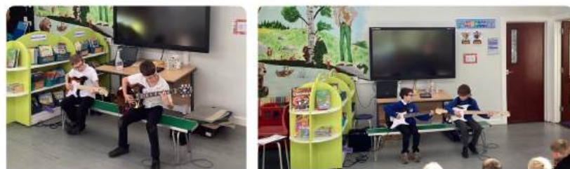
Amazing guitar performances in our achievement assembly