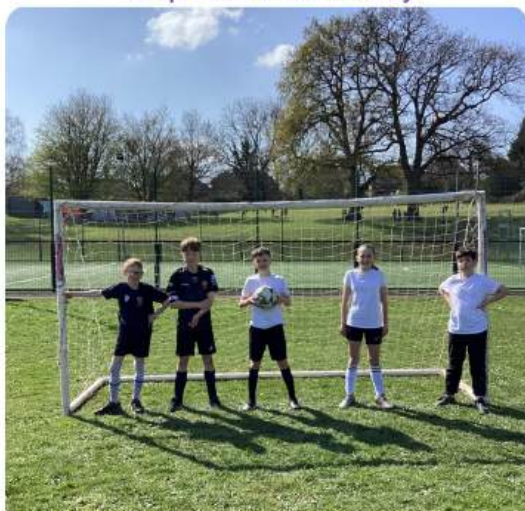
Our football team were complemented on their resilience and determination