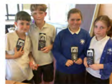
Concord Maths Challenge