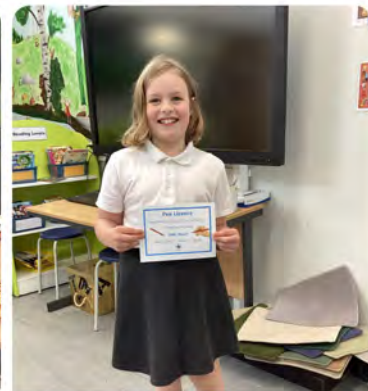
A proud holder of a Pen Pal Certificate