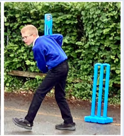
Cricket in Class Severn