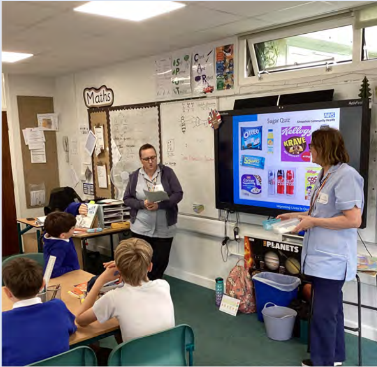
Brilliant Bodies presentation in Class Severn