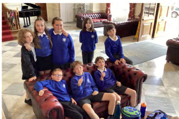
Years 5 and 6 enjoying a mask-decorating workshop and a performance of Twelfth Night at Concord College