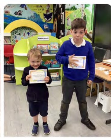
Stars of the Week