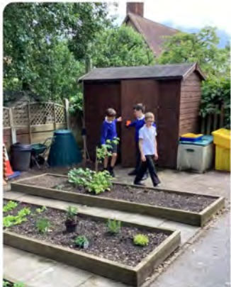
Class Severn tending to the vegetable beds