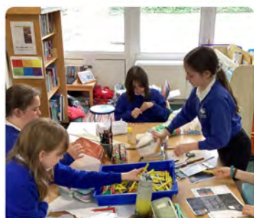
Class Severn's ongoing work on vehicle alarm systems in DT