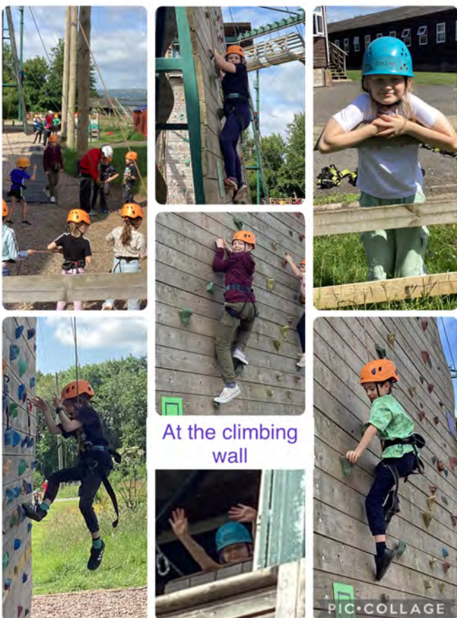
At the climbing wall