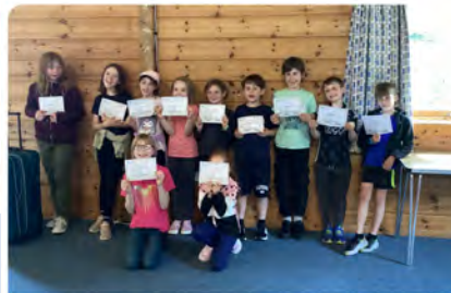
Certificate winners and group photo