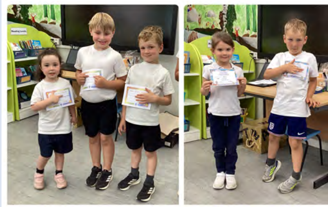
Stars of the Week