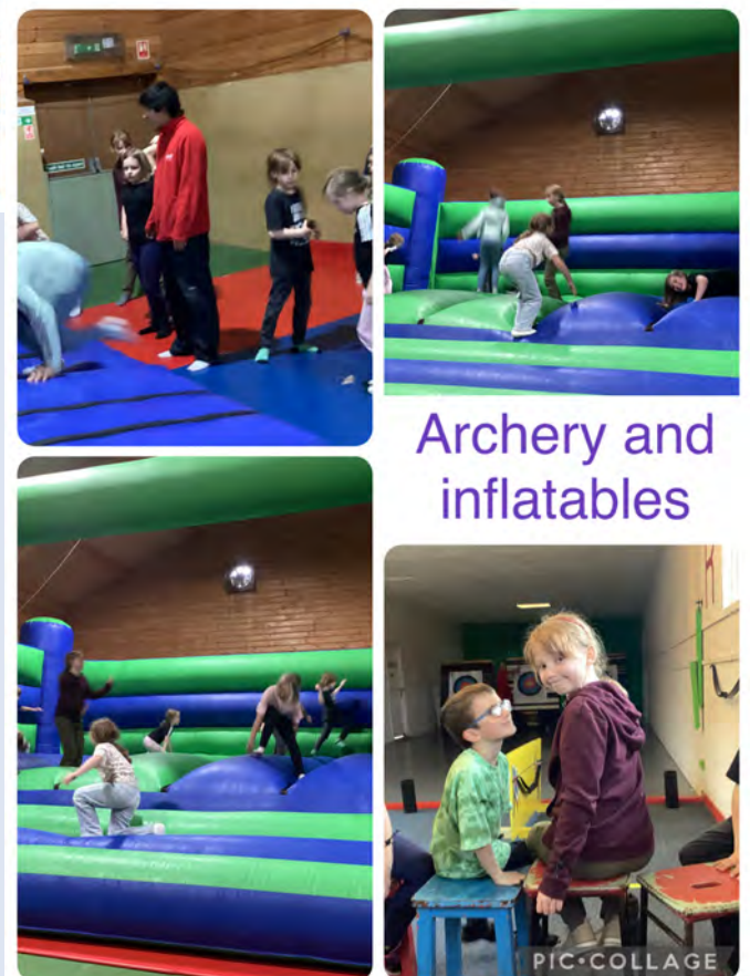
Archery and inflatables