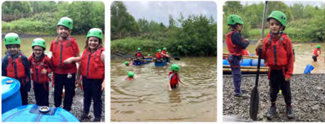
Rafting fun in the rain