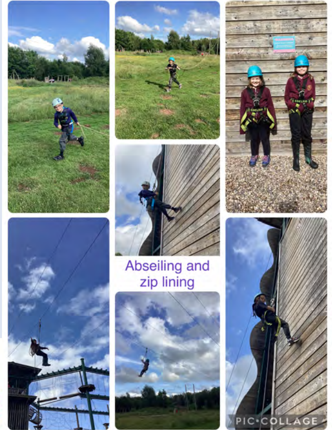
Abseiling and zip lining