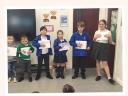
Spring 2 Sports Stars