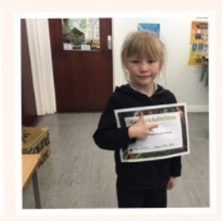
All keywords completed! Well Done