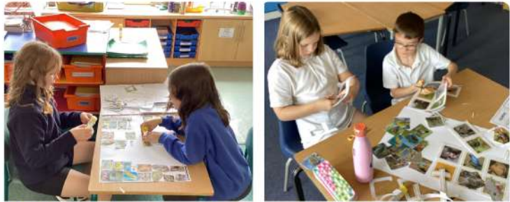
Animal classification work in Class Severn