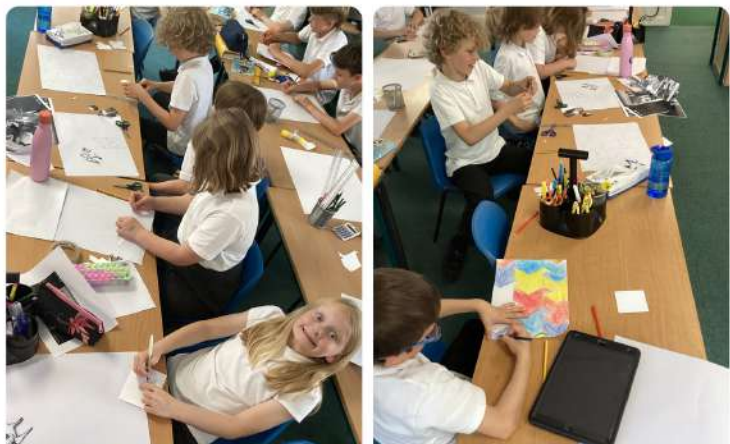
Tessellation artwork in Class Severn