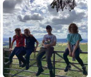
Walking along the Long Mynd