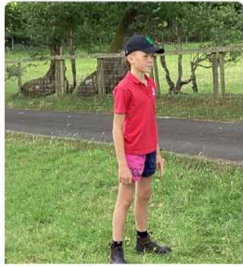
Year 6 activities at Arthog