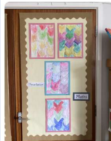
A super selection of work on display in Class Severn