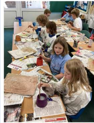
The next phase of the contour model project