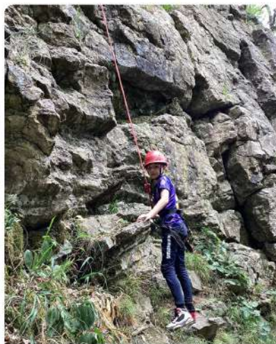
Rock climbing at Ippikins Rock